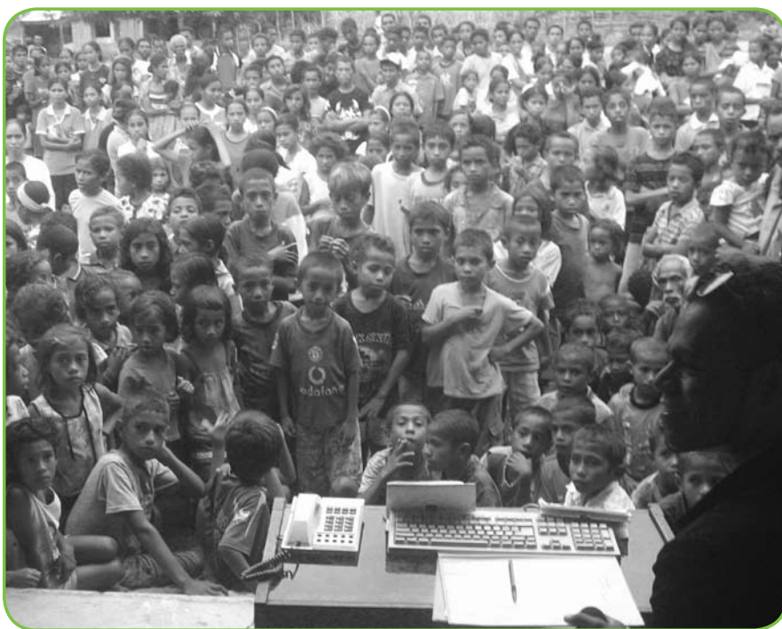
A large audience gathers to watch a performance

But it's not just potential employment that brings students to KBH, many students are drawn to theatre because they like funny slap-stick style performances. One