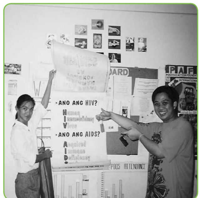
PAFPI staff doing an information session on HIV/AIDS

Over the past decade, over 200,000 workers have been educated about HIV and what steps people must take to avoid the virus, and hundreds of people living with HIV have received support, assistance and counseling to help them cope with their illness. Thanks to an extremely dedicated and committed staff of mainly volunteers, PAFPI continues to deliver information to those who need it and hope to those who had lost it.