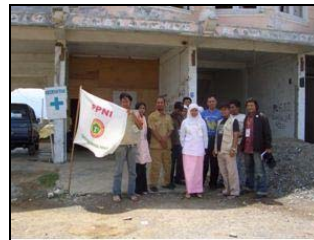
Volunteers from PPNI, the Indonesian nurses' association, run a clinic in a devastated part of the city of Banda Aceh