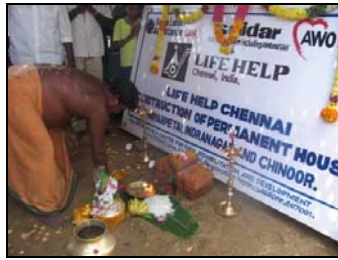
Part of the inauguration ceremony