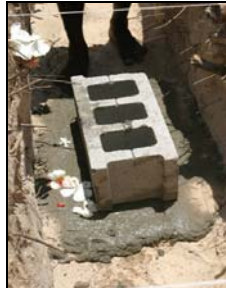
First foundation stone laid in Uduthurai site