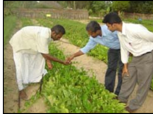
RRI- TECH training Programme

of these people came to Galle to take part in a cross-border training programme on Analog Forestry. At the completion of this workshop, a one year Analog Forestry reforestation programme was designed in order to help assist TECH and its beneficiary farming communities in Vadamarachchi East. The objective of the follow up training programme is to assess the successes and drawbacks of the implementation of the one year model.