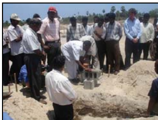
Foundation stone laying ceremony in Uduthurai

For the houses in Uduthurai Village, UNOPS utilizes a different technical design where the houses' structure has a steel frame. This house type provides several advantages compared with the traditional construction method applied in the other villages. It can be constructed faster (30% time saving) and needs less environmentally sensitive materials. The appearance of the completed houses is expected to vary only slightly from houses built with traditional materials but the layout will be the same as in the other villages (All houses have a ground floor of 500 square feet and have two bedrooms, a living area, kitchen, wooden-framed windows with glass panes). The design specifications of the "UNOPS-house" has also been approved by the Urban Development Authority (UDA) and the Planning and Development Secretariat (PDS) technical teams in Kilinochchi.