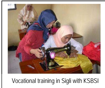
Vocational training in Sigli with KSBSI

APHEDA works to build self-reliance through support to educational and training programs for workers and their trade unions.