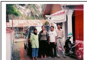
Union Aid Abroad-APHEDA office in Aceh

Union Aid Abroad – APHEDA began supporting emergency relief activities in Aceh shortly after the earthquake and tsunami on 26 December 2004.