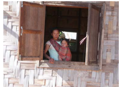
Images: camp life – it is very crowded in a refugee camp; SHC medics doing their work; mother and child at the SHC clinic in camp