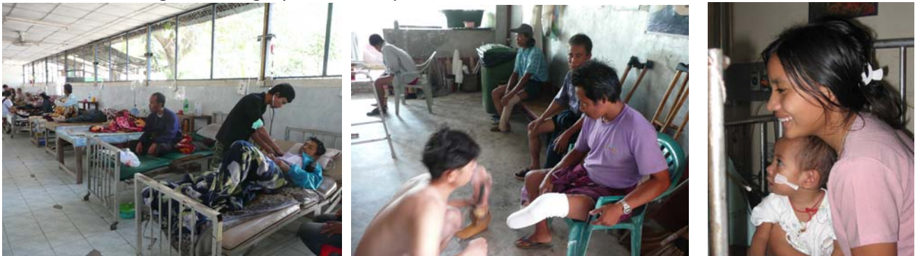
Images from left: Patients being treated at the Mae Tao Clinic; Prosthetics fitting; Baby and mother with the BCMF special needs program.

We will also hear about the important work of the Burma Children Medical Fund (BCMF) who organise the logistics and fund the treatment of seriously ill children (and adults) from Burma. Most of their patients are referred to them by the Mae Tao Clinic as well as other larger organisations and Thai hospitals in the area. BCMF's patients all need specialised medical care and treatment which is not available on the border. BCMF has developed a unique relationship with the Thai authorities and each week they send a van to Chiang Mai for further investigation, surgery or follow-up.