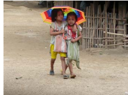
Images from left: The DARE education and rehabilitation team; Camp life in a KWO student dormitory; Camp life for some young girls

Next we will visit projects run by the Karen Women's Organisation (KWO) such as the women's capacity building training, women's health project and school dormitories for unaccompanied minors. You will be able to see firsthand the wide scope of the work that KWO does for their community.