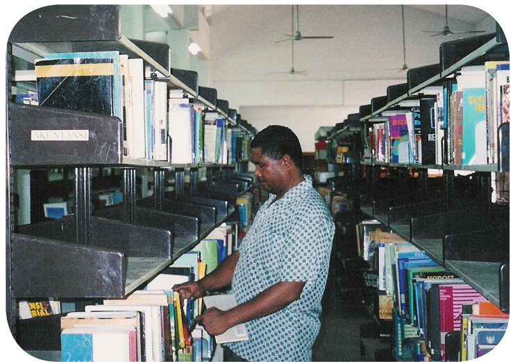
UNTL employee sorts books on shelves funded by this project ▼

During the past year the focus of the project has been to purchase new books, many of which are required to replace the books damaged or destroyed during the unrest in 2006 and 2007.