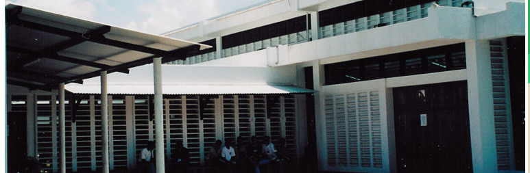
▲ The rebuilt Library at the National University of East Timor, Dili