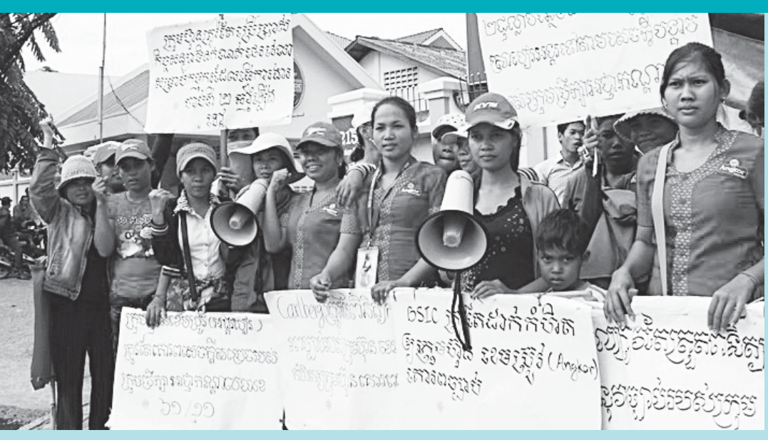
With support from Union Aid Abroad-APHEDA, the CFSWF has won new laws giving its members, like these beer promotion workers, the same rights as other Cambodian workers.