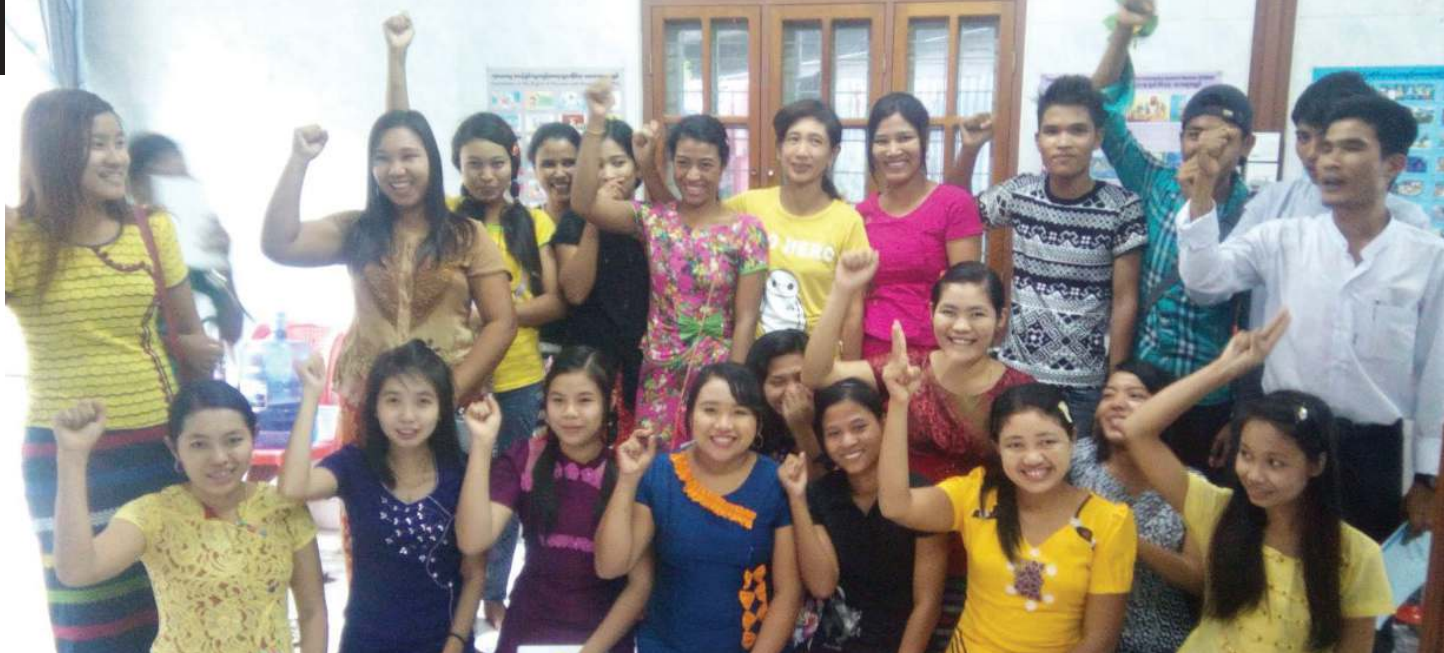
Union activists from garment factories in North Oukkalarpa Township, near Myanmar's capital Yangon, complete their worker representative training with Union Aid Abroad-APHEDA partner organisation, Action Labor Rights.