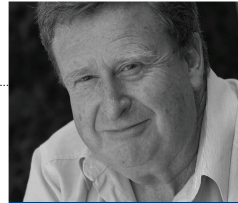
ROB DURBRIDGE MEMORIAL SCHOLARSHIP

If you were successful how do you think you might organise others at work or in the union to be active and interested in global justice work?